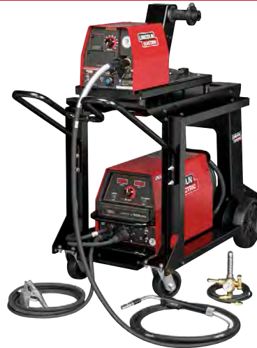
Shown: Invertec® V350 PRO Factory Model/ LF-72 Heavy Duty Wire Feeder Ready-Pak®